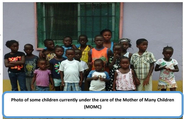
Photo of some children currently under the care of the Mother of Many Children (MOMC)