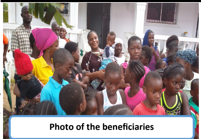
Photo of the beneficiaries