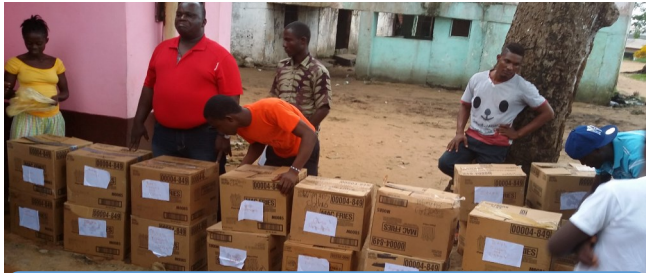
Photo of the items received