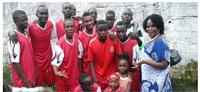
The Team The Youth